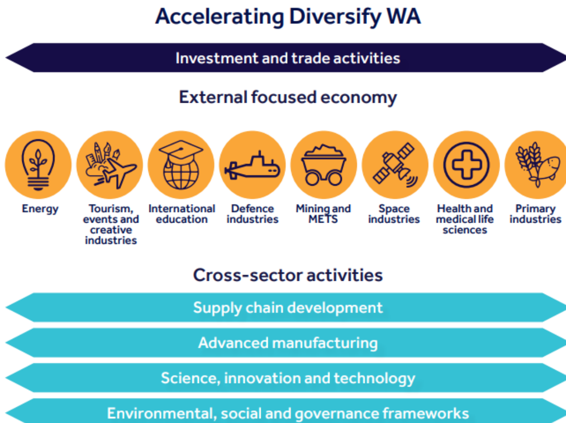
Figure 1. Priority sectors for strategic development in WA

Within the context of Diversify WA, the Plan aims to create a positive environment for industry to invest in supply chain activities by focusing on key enablers, including investment attraction.